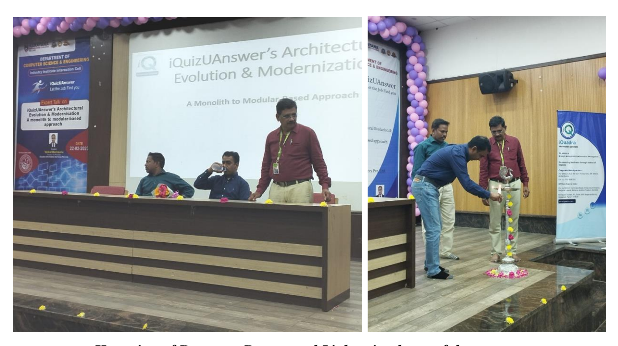
Honoring of Resource Person and Lightening lamp of the event

iQuadra provides technology and information services to its esteemed clients and is committed to delivering innovative solutions for them. Helps identify top talent at break neck speeds. Shake hands with the new hire in a jiffy. The talent that is vetted by the state of the art Performance Metrics system that oversees all traits needed in a job seeker.