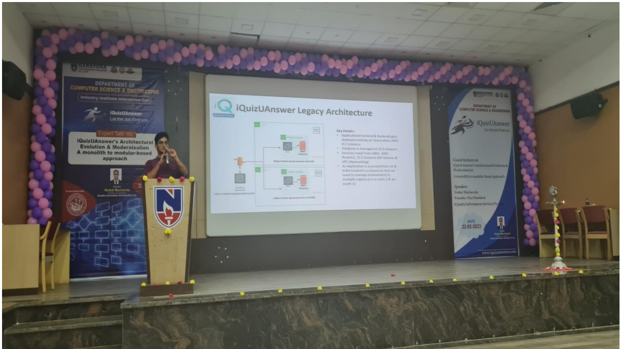
Resource Person addressing to the event

Resource person explaining about the iquizUanswer legacy architecture which will work on Amazon Web Services Elastic Cloud instances